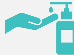
Hand Sanitizer Stations